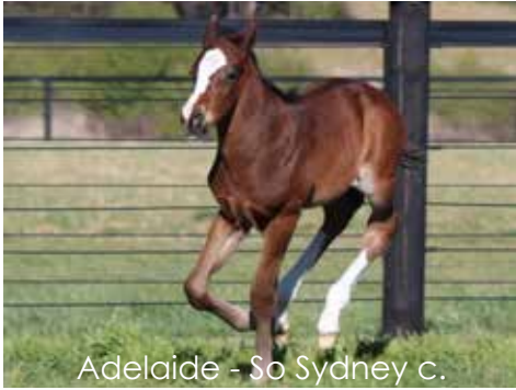
Adelaide - So Sydney c.