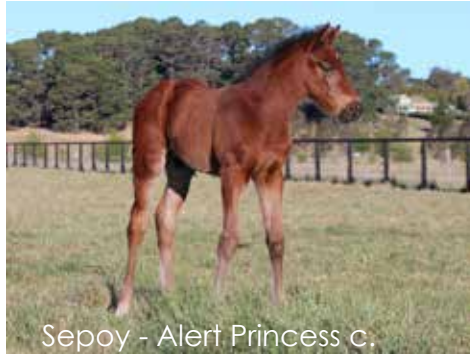
Sepoy - Alert Princess c.