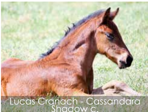
Lucas Cranach - Cassandra Shadow c.