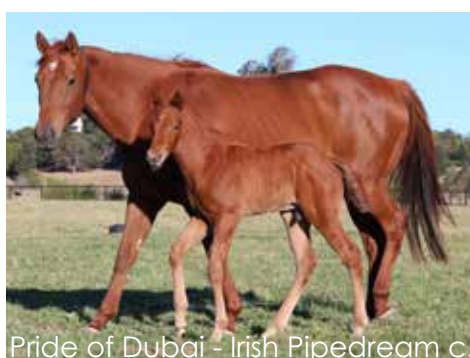
Pride of Dubai - Irish Pipedream c.