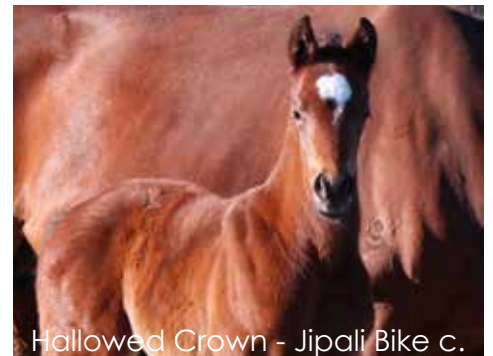
Hallowed Crown - Jipali Bike c.