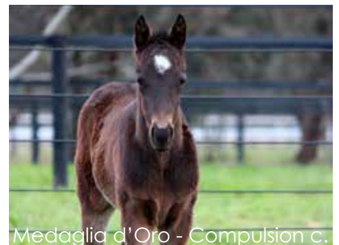
Medaglia d'Oro - Compulsion c.