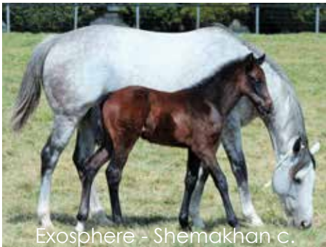
Exosphere - Shemakhan c.