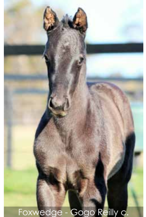
Foxwedge - Gogo Reilly c.