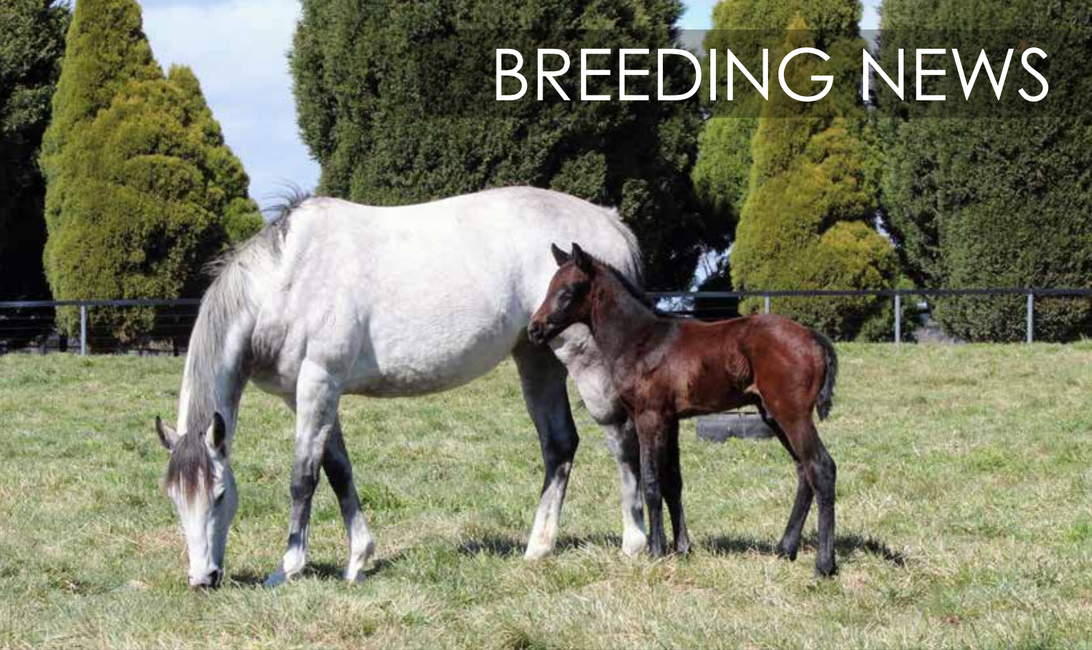
Exosphere ex Shemakhan colt

The breeding season has got off to a roaring start for the Lime Country / Retford Equine Clinic / Silvio partnership. Thus far stats are sitting on a very healthy 88% conception rate for 1st covers. Walking-out our resident mares to the Hunter means the mares have to be at their utmost ready for conception. It is essential that everything is spot-on, especially when covering space for some stallions is harder to get than a slot in The Everest :)