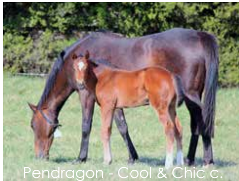
Pendragon - Cool & Chic c.