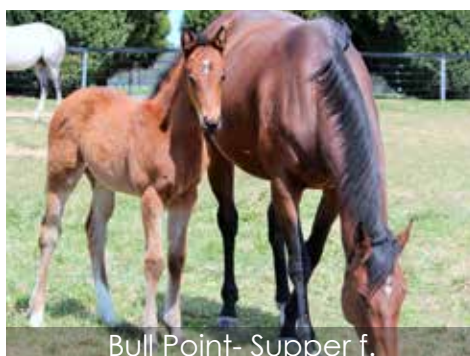
Bull Point- Supper f.