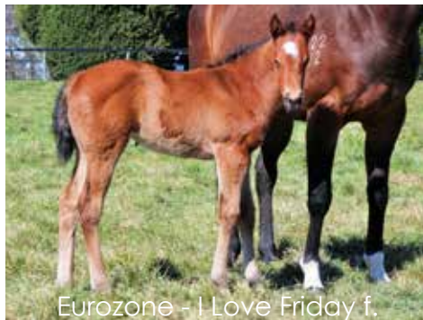
Eurozone - I Love Friday f.