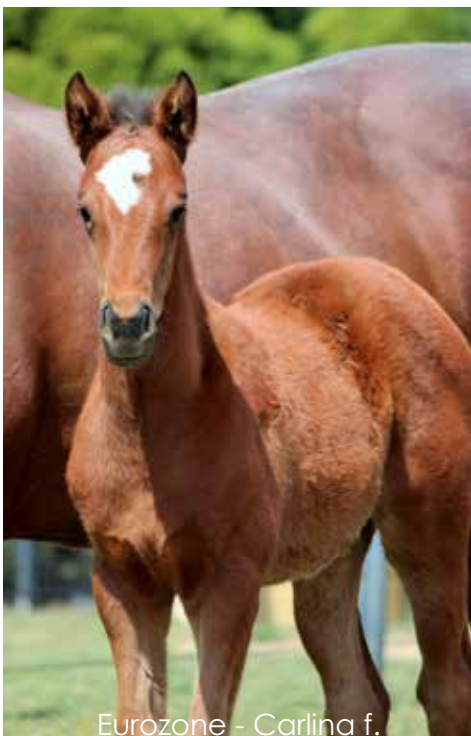
Eurozone - Carlina f.