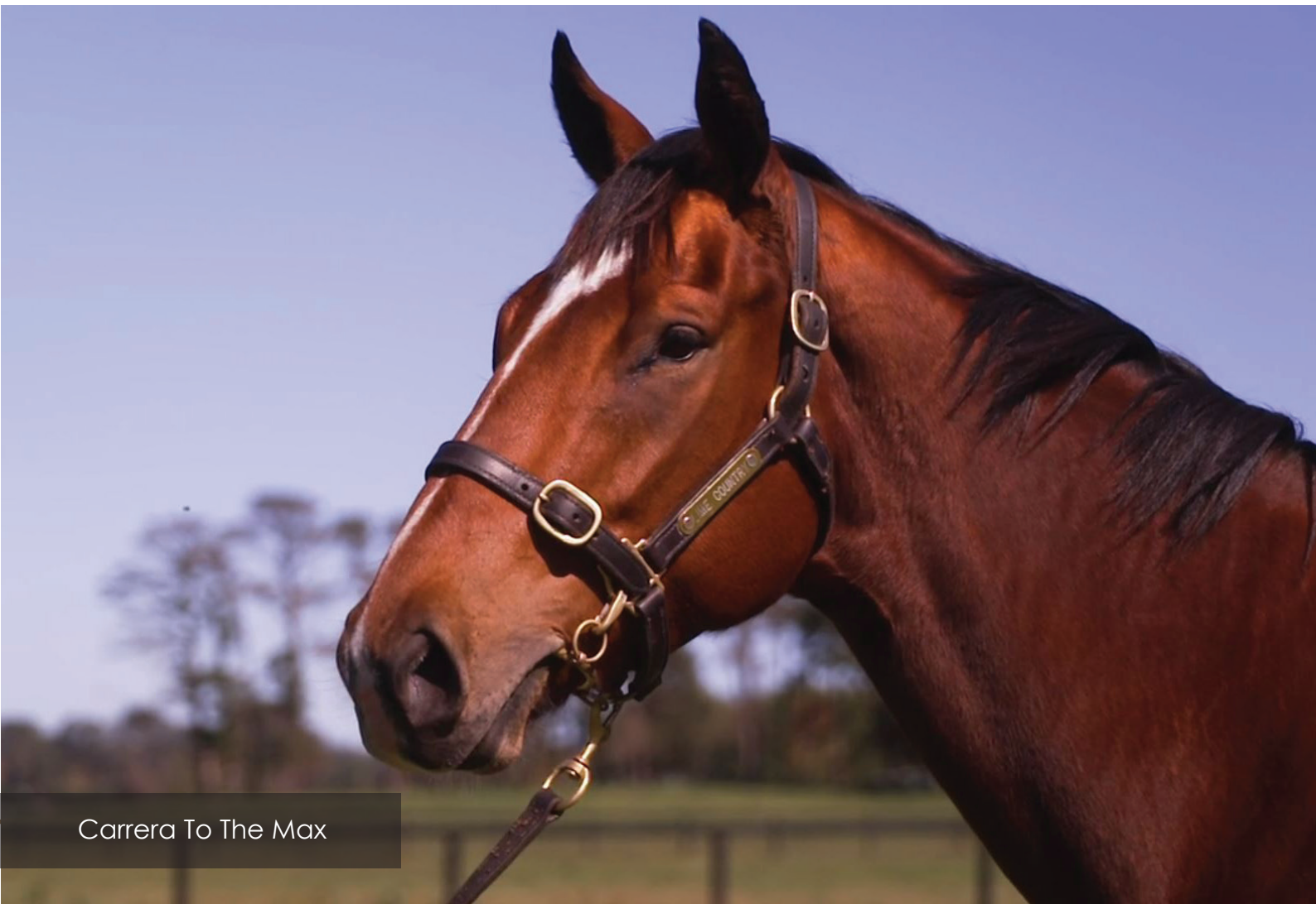
Carrera To The Max

She arrived at Lime Country on the 26th of January 2020 to be prepared for sale.