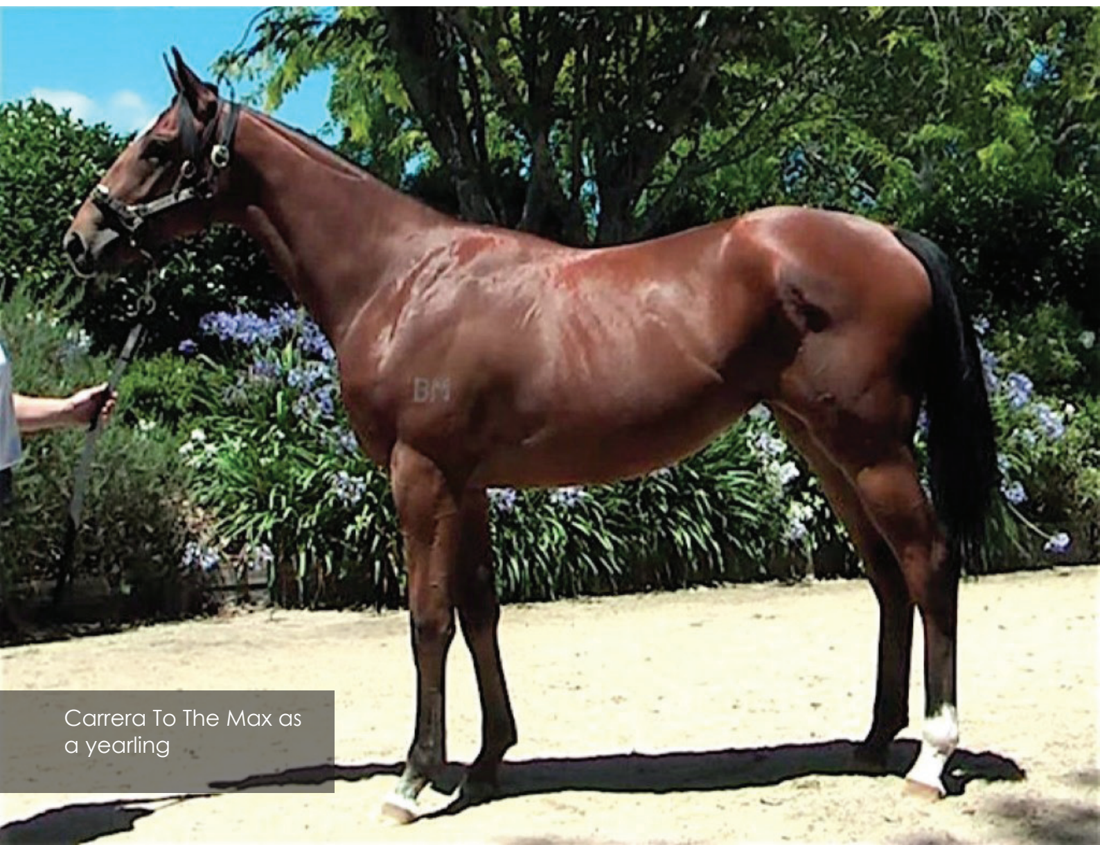
Carrera To The Max as a yearling

This mare is being offered as the owner is reducing his racing stock going forward.